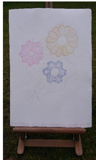
Patchwork flowers (2019)

monoprint from patchworked fabric from a series of 12 size: 49x35cm £70